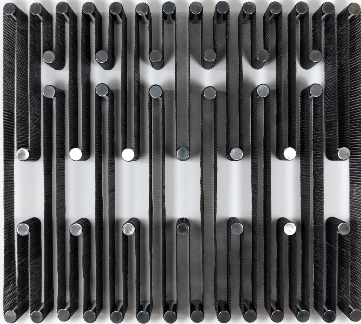
Artur Lescher Rio de parede 2021 Stainless steel Edition: 1/1 + 2 AP 165 x 181,3 x 27 cm