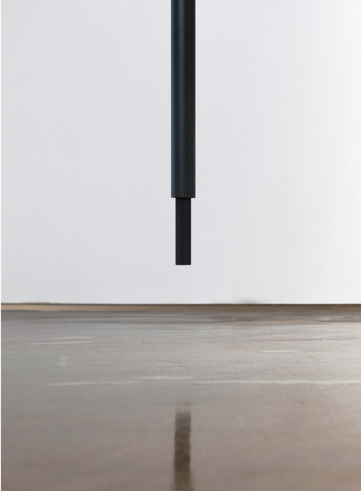
TELESCOPICA #05 (DETAIL), 2013