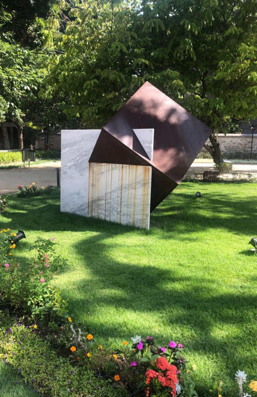
Tulio Pinto Land Line #12 , 2018 Corten steel and marble 275 x 300 x 275 cm