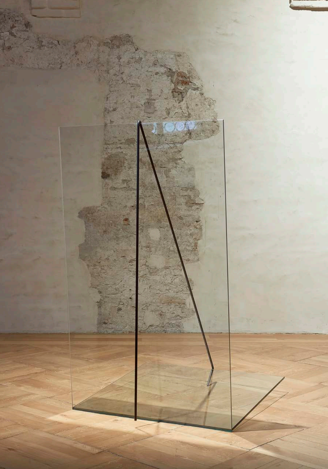
Tulio Pinto Escaleno , 2018 Glass and steel bar 151 x 102 x 90 cm