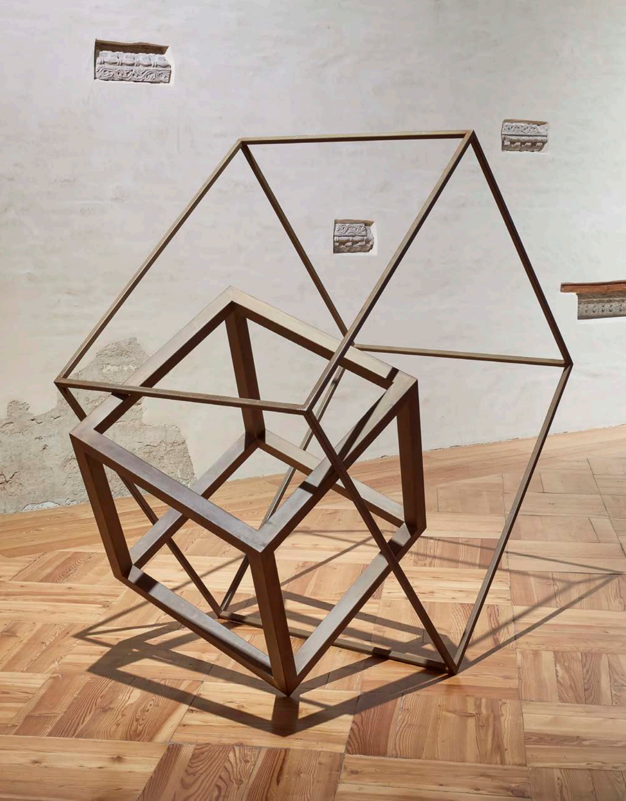
Tulio Pinto Linha de Terra #11 , 2017 Steel cube 200 x 116 x 93 cm