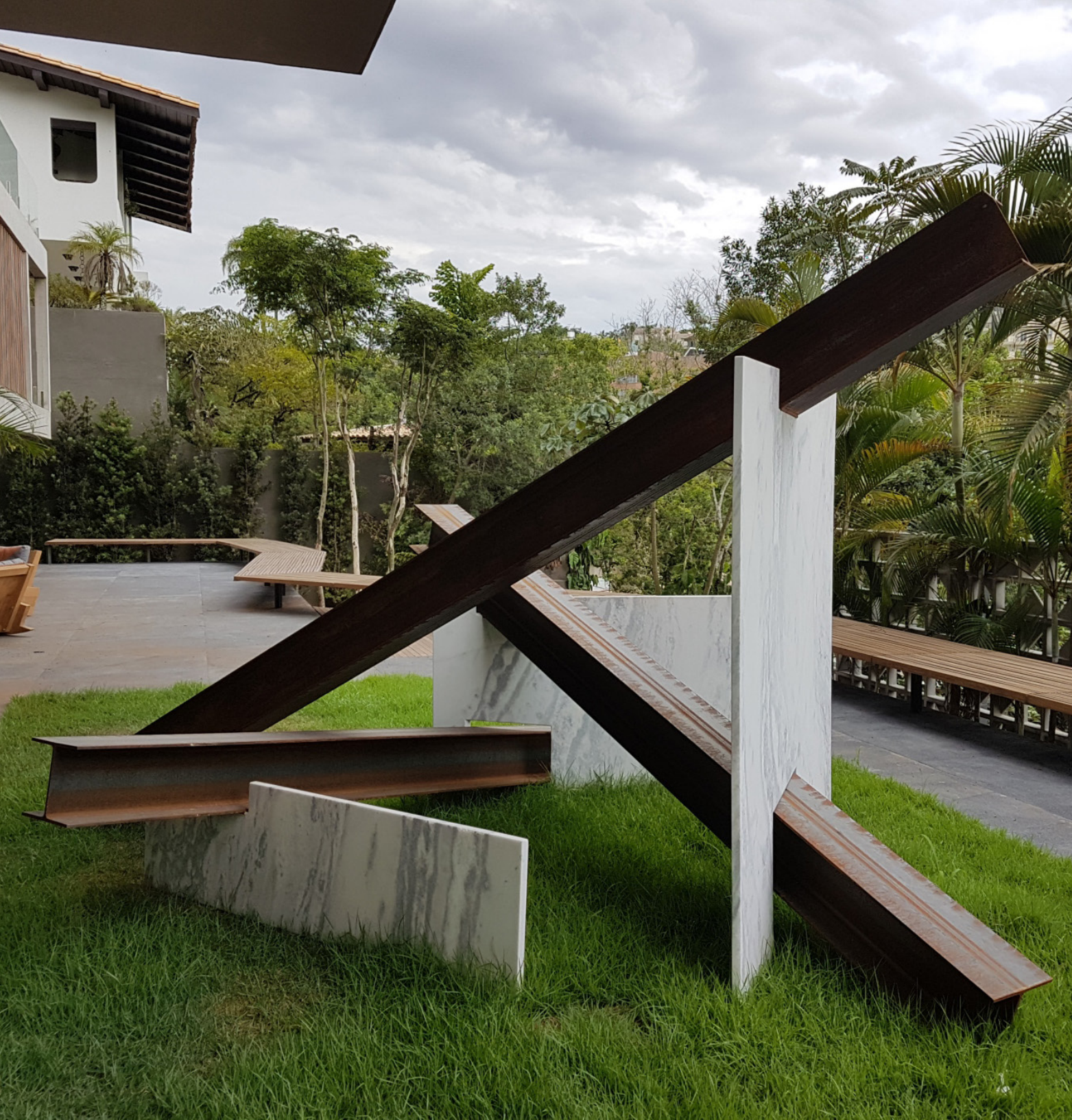
Tulio Pinto Vectors #6 , 2019 Steel beams and marble 230 x 430 x 350 cm