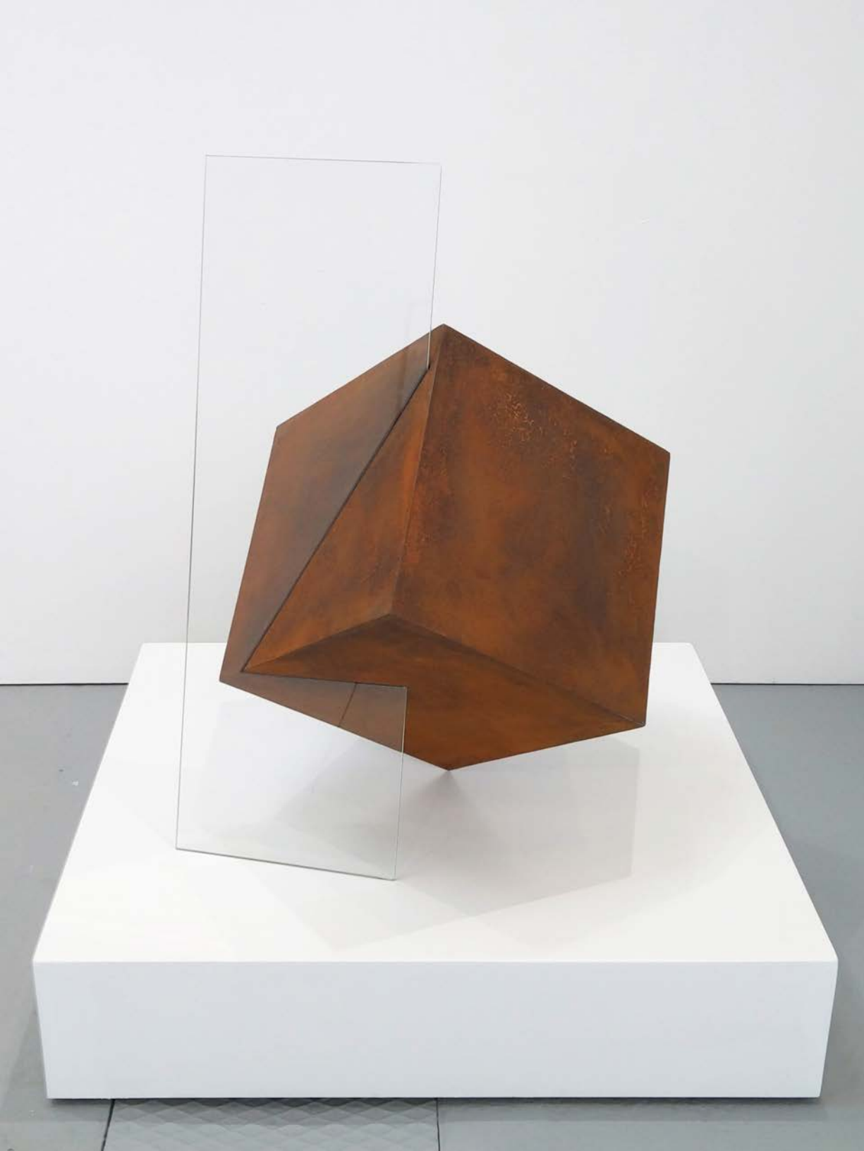
Tulio Pinto Land Line #4 , 2016 Glass and steel 90 x 60 x 60 cm