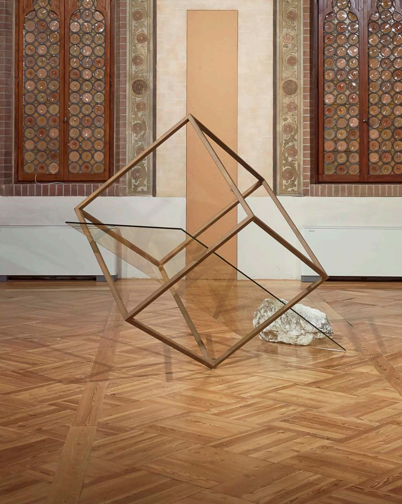
Tulio Pinto Linha de Terra #9 , 2017 Steel cube, stone, glass 163 x 163 x 205 cm