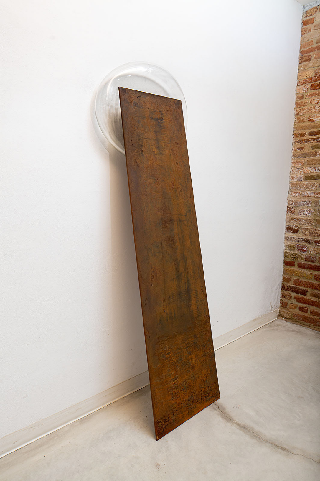
Tulio Pinto Cumplicidade #23 , 2019 Blown glass and steel 165 x 55 x 50 cm