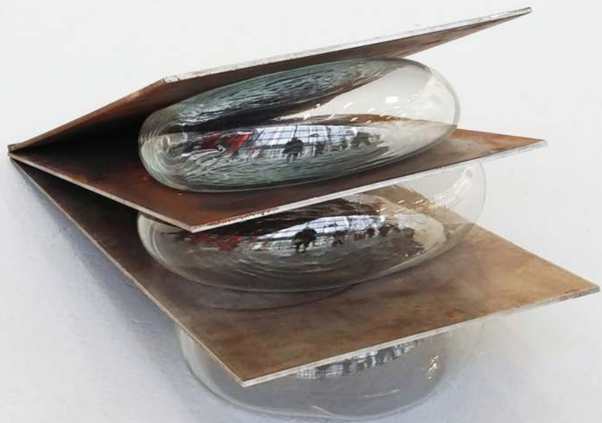
Tulio Pinto Cumplicidade #20 , 2018 Blown glass and steel 50 x 110 x 55 cm